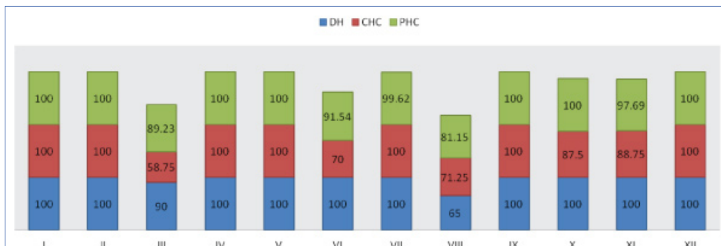
[Table/Fig-3]: Evaluation of twelve criteria at district hospital, four CHCs and thirteen PHCs.

It was observed that at district hospital 92% criteria were graded 'A' i.e., very good and only 8% were graded as 'B' i.e., good. While at CHCs, 75% of criteria lied in category of very good (Grade A) and 25% were only good (Grade B). At all the 13 PHCs, all the criteria were graded 'A' with more than 75% compliance.